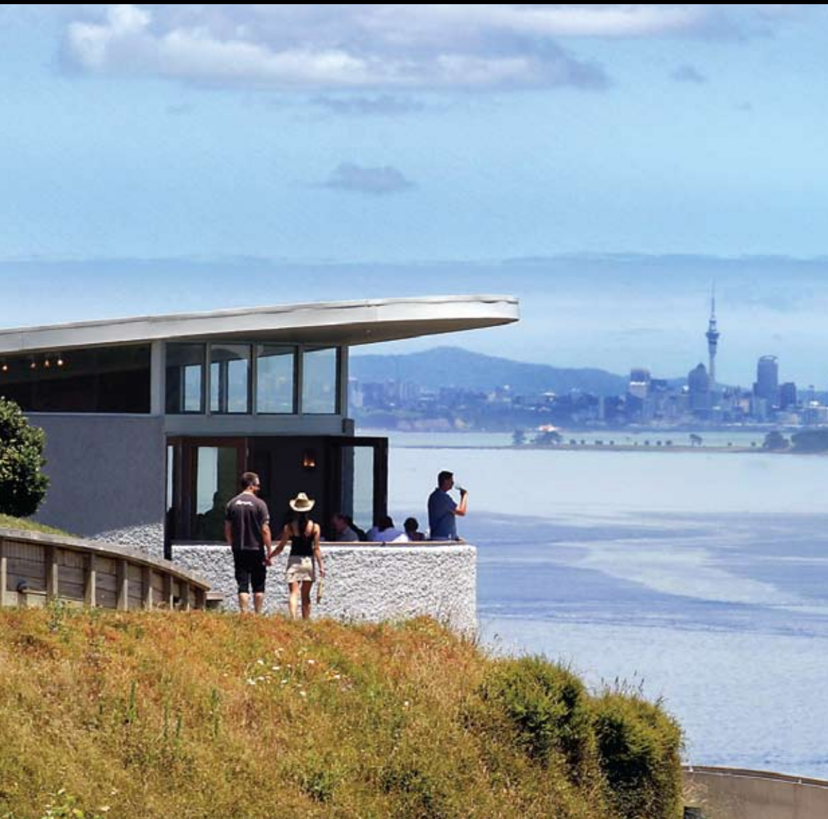
Auckland in the distance from Te Whau

HOURS MON - WED 10AM-7PM THURS - SAT 10AM-9PM SUN 11AM-7PM